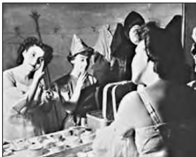
Students prepare for USD Theatre's 1954 production of A Midsummer Night's Dream in this photo from the "USD Photograph Collection" exhibit, scheduled for February and March at CWS.

Art for the Ages II —The Center for Western Studies is pleased to host a second show and sale for the Center for Active Generations arts group from April 8-June 3, 2006. The 2005 show and sale was a great success and we invite the public stop in and support these wonderful local artists. The group has oil, watercolor, and pen-and-ink pieces as well as woodcarving and other crafts available for show and sale. We will schedule a reception for the event.