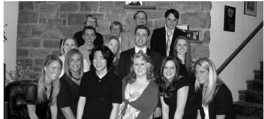
Iota Mu chapter members gather for a photo at the Spring 2009 initiation ceremony on April 5, 2009.