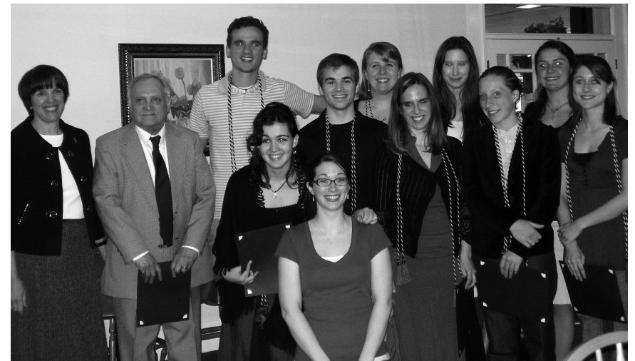
Mu Iota chapter initiation at SUNY at Geneseo