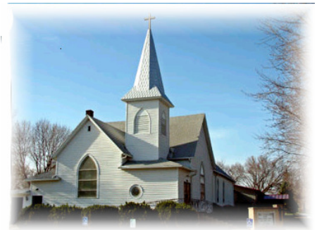
Scandia Lutheran Church Centerville, SD