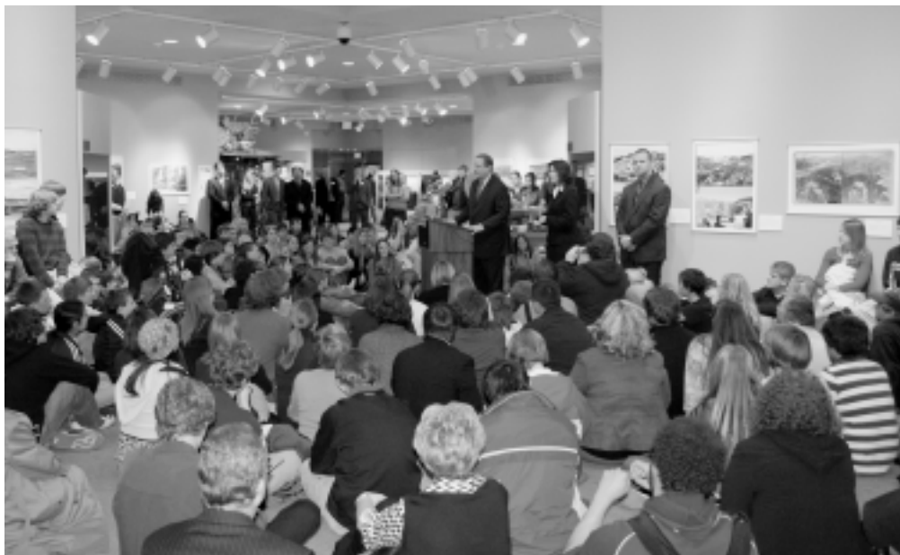
Former Vice President Al Gore speaks to more than 300 high school and college students at the Fantle building January 23rd.

The former Vice President's message was based on his documentary film, "An Inconvenient Truth," which the Center had provided in DVD form to several student groups ahead of the talk. The film, which went on to win two Oscars, pointed out that human beings are the cause of global warming—now evident from increases in air and water temperatures around the globe, including widespread melting of ice and snow