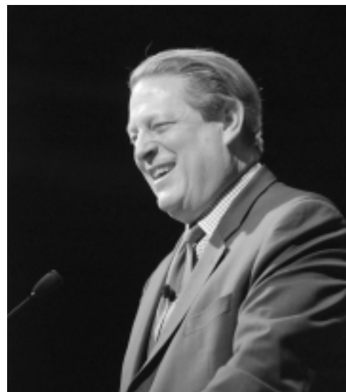
Former Vice President Al Gore revealed his sense of humor during the Boe Forum.

The Center owes a resounding vote of thanks to the dozens of Augustana personnel who helped to make the visit a success.