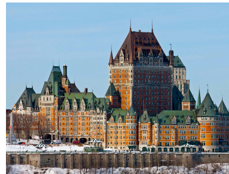
Québec City & Chicoutimi, Canada