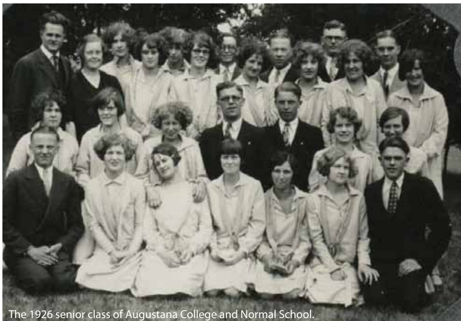
The 1926 senior class of Augustana College and Normal School.

years later the first baseball and football teams were formally organized. And in 1929, students, alumni and community members celebrated homecoming as the first official Viking Day.